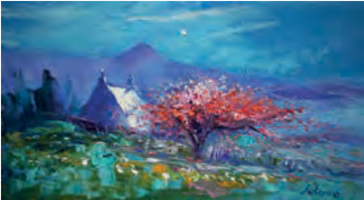
Blossoms under Ben More Isle of Mull oil on canvas 10 x 18 inches £3200