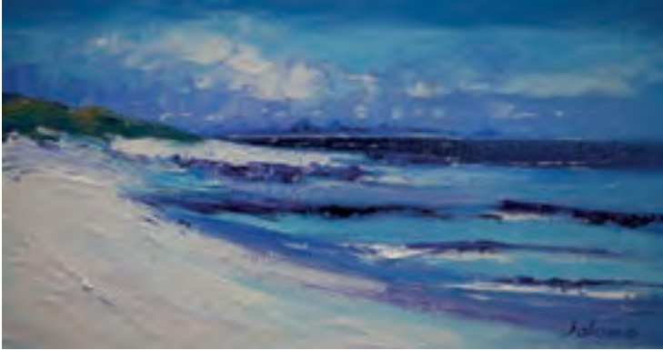
Fresh seas Balnahard Beach Isle of Colonsay oil on canvas 10 x 18 inches £3200